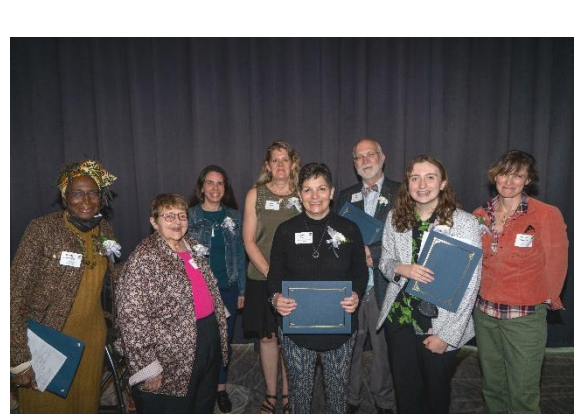
2022 Award Recipients